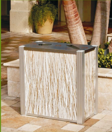
Double Recycler with 3Form Bear Grass Life resin panels