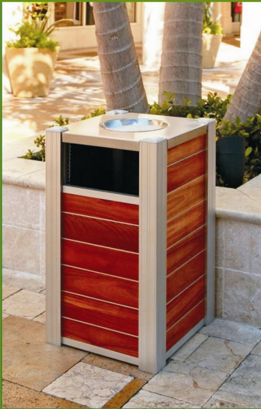
Side-entry Trash Bin with optional Ash Tray (Shown in Lyptus wood with Zephyr aluminum banding)